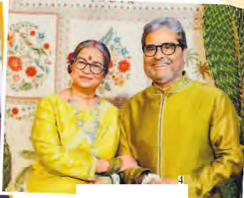
Singer Rekha Bhardwaj and filmmaker Vishal Bhardwaj will open the fest with a ghazal and Sufi recital