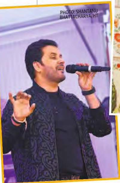
Singer Javed Ali will conclude the fest with his Sufi notes